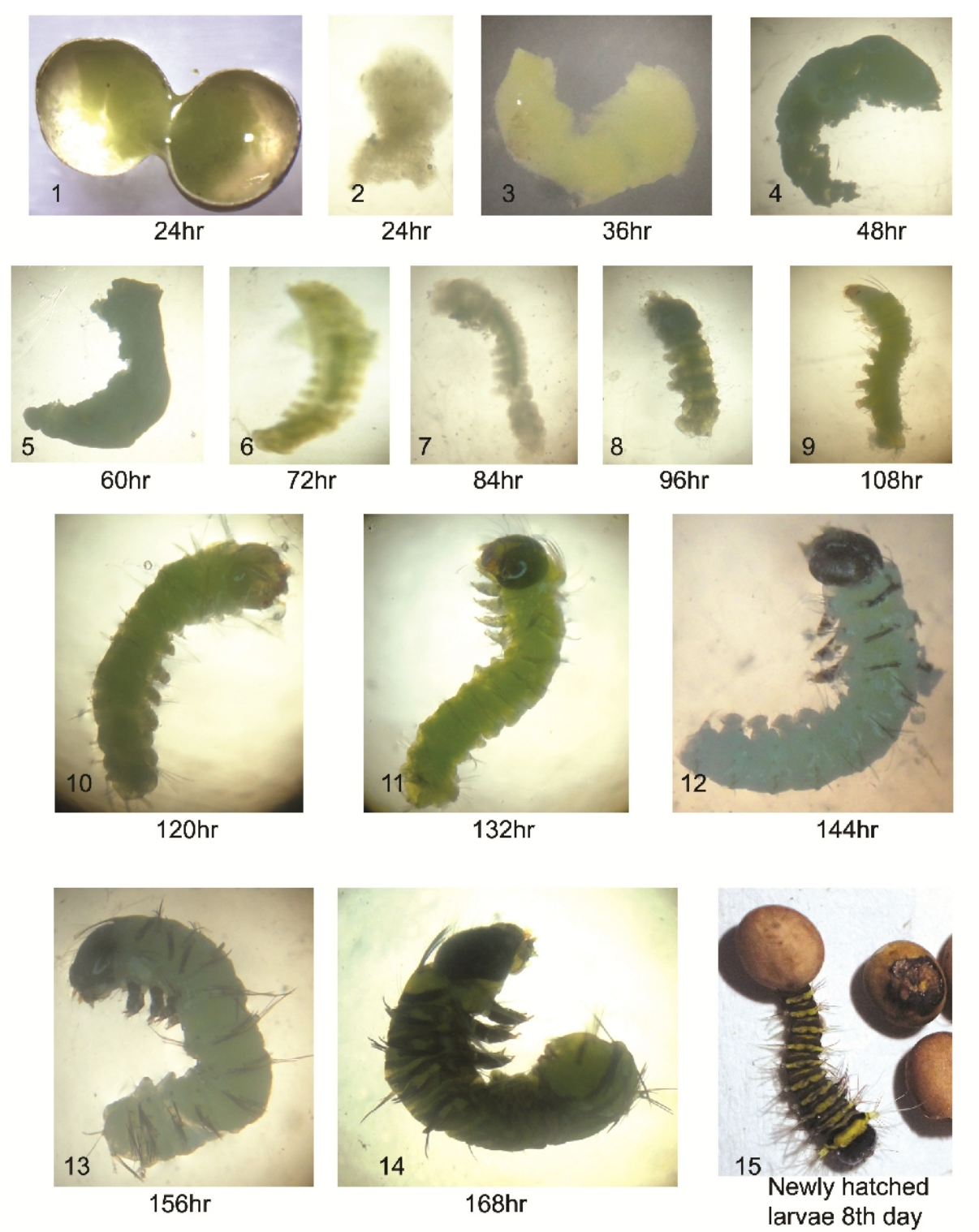
Fig. 2. 1-15. Different developmental stages of embryos of muga silkworm (24 h to till hatching).

h, the development of embryo was well differentiated into head and trunk region (Fig. 2B). Stage-5, 6 & 7: The embryo gradually contracts to the shape of Dharuma (Japanese doll). Gradually the head and tail region can be identified. After 48 h, segmentation of the body is clearly visible.